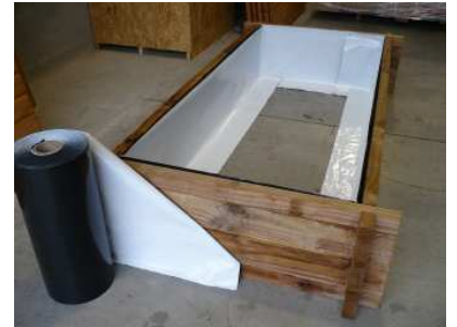
Triple Height Garden ↘