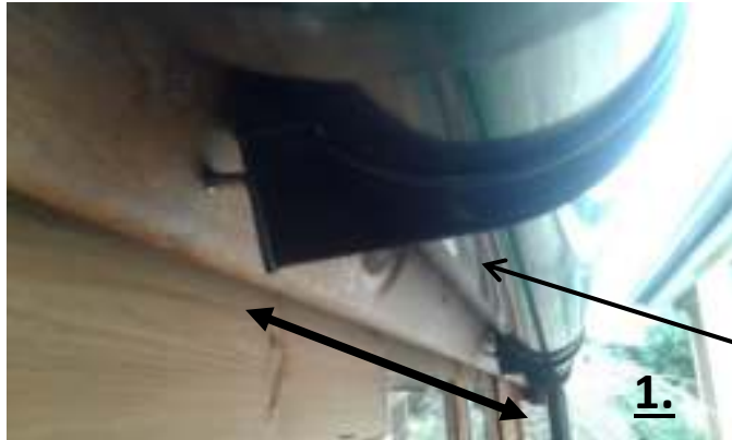
500mm Maximum centres

Fix Gutter Support Clips & Joiners at a Maximum of 500mm centres using a string line. A fall of 5.5mm per 2 mtrs is recommended, and an expansion gap of 4mm. Fix using 8x25 square drive stainless screws.