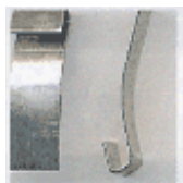
Aluminium overlap clips are flexible to allow for glass Tolerance