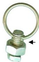
$2.50 Crop Support Clips, fix in rafter channel at desired location & tie crop strings.