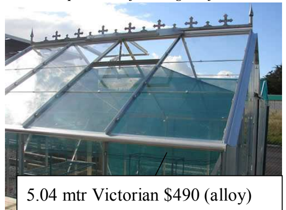
5.04 mtr Victorian $490 (alloy)