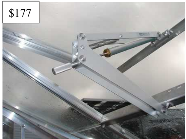
Optional temperature actuated vent opener