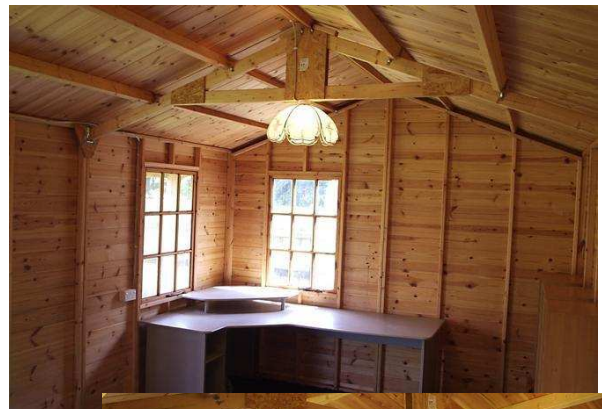
Above: 2.400 x 3.600 GR Below: 2.400 x3.600 GR